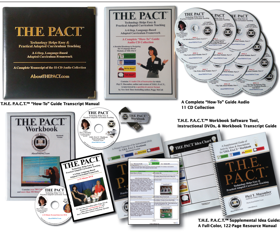
T.H.E. P.A.C.T.™ "How-To" Guide Transcript Manual

. . . regardless of what you are teaching!